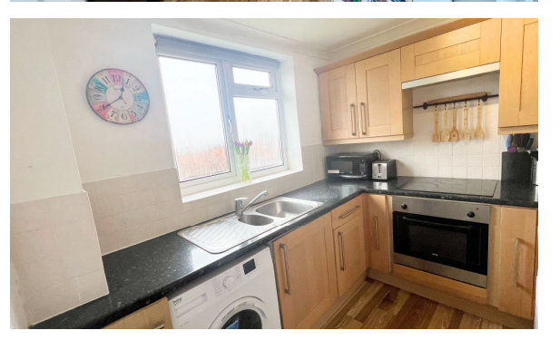
FLAT 5, BREDON COURT, HILL VILLAGE ROAD, FOUR OAKS, B75 5JD - OFFERS AROUND £175,000