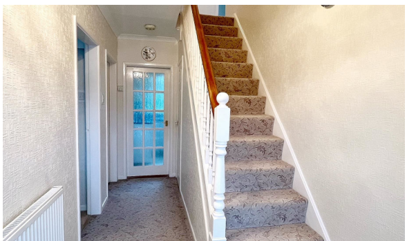
37 LONGDON DRIVE, FOUR OAKS, B74 4RF - GUIDE PRICE £450,000