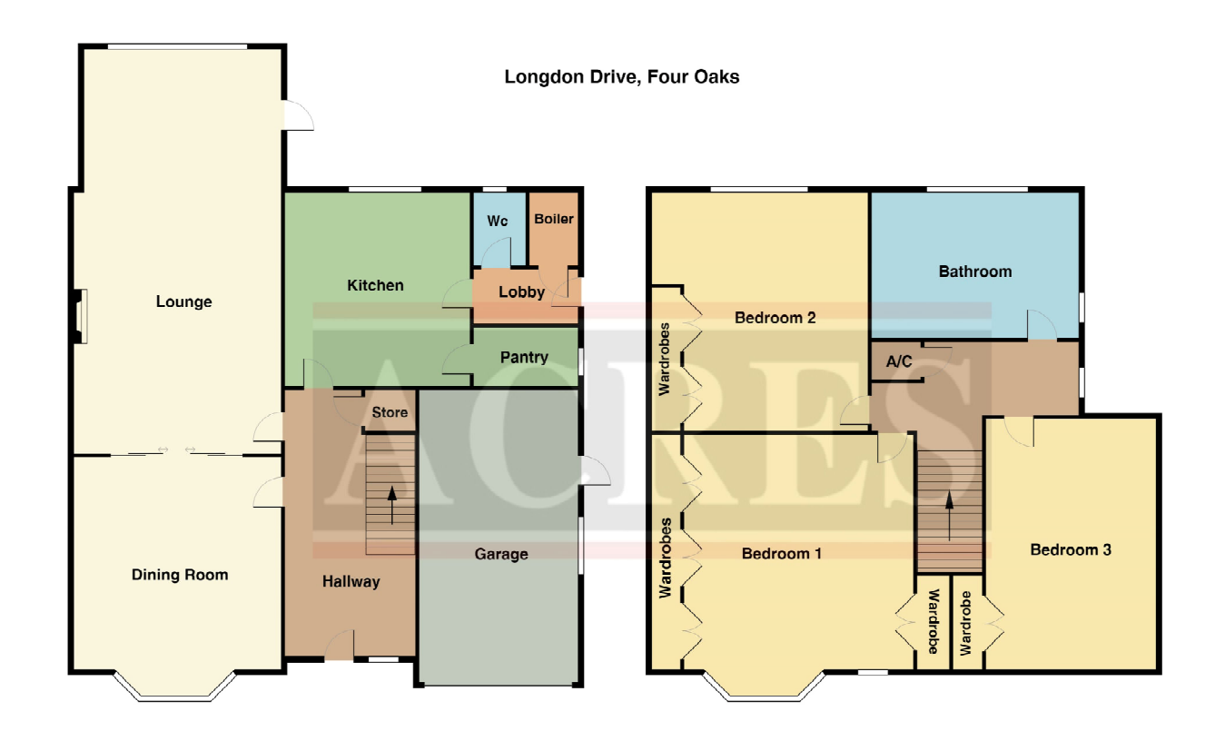
THIS PLAN IS NOT TO SCALE AND IS GIVEN TO PROVIDE A GENERAL GUIDE. IT MERELY INDICATES APPROXIMATE RELATIONSHIP OF ONE ROOM TO ANOTHER.