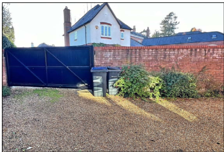
Nursery Lane, Four Oaks