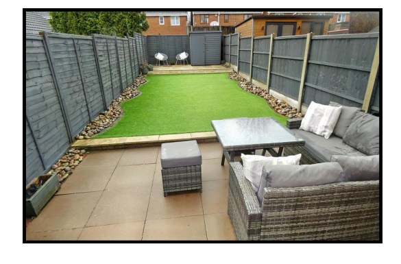
196 Dovedale Road, Erdington, B23 5BP ~ Offers around £200,000