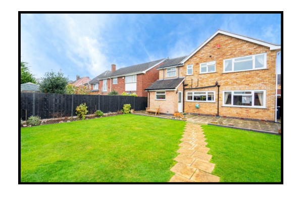
20 Wheatmoor Rise, Sutton Coldfield, B75 6AW~ Offers around £525,000