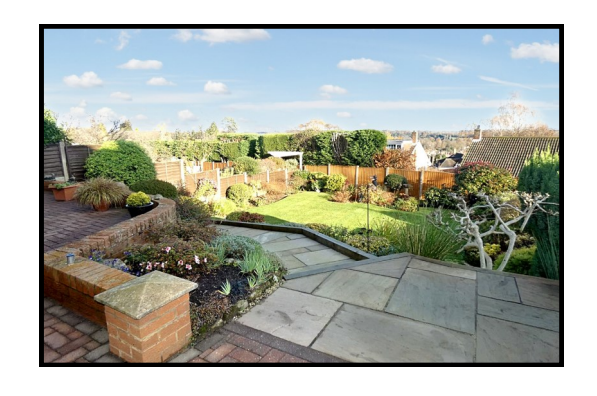
17 Hawthorn Road, Wylde Green, Sutton Coldfield, B72 1ES ~ Offers over £500,000