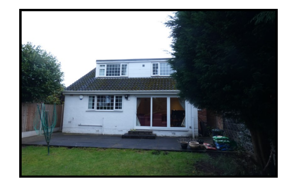
4 DUNCHURCH CRESCENT, SUTTON COLDFIELD, B73 6QN OFFERS AROUND £425,000