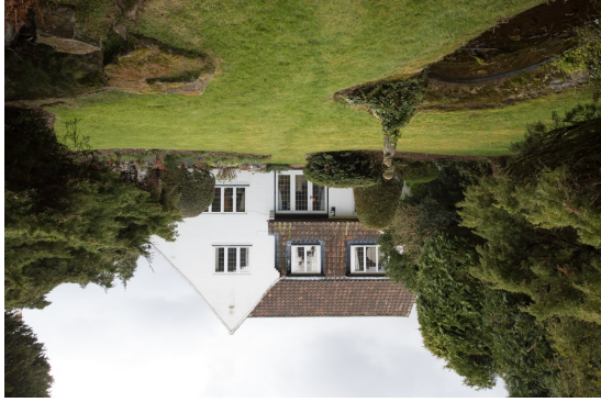
5 St. Bernards Road