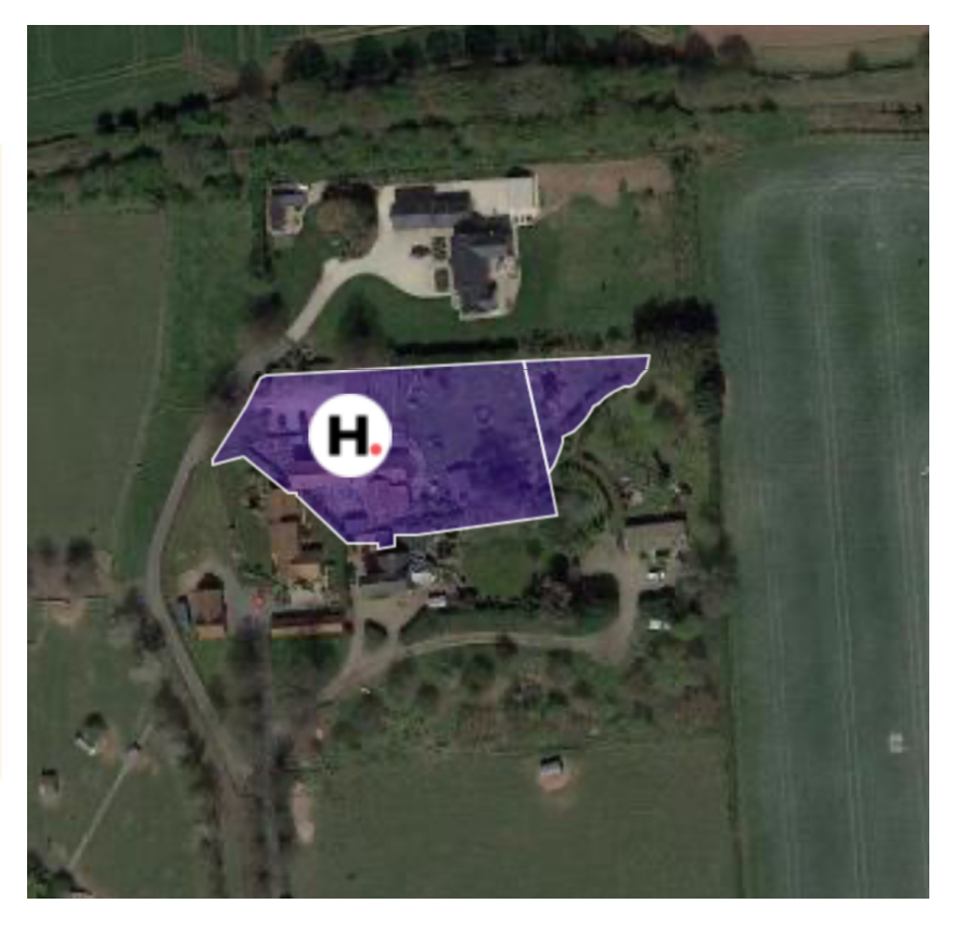
TOTAL AREA: APPROX. 378.4 SQ. METRES (4073.6 SQ. FEET)