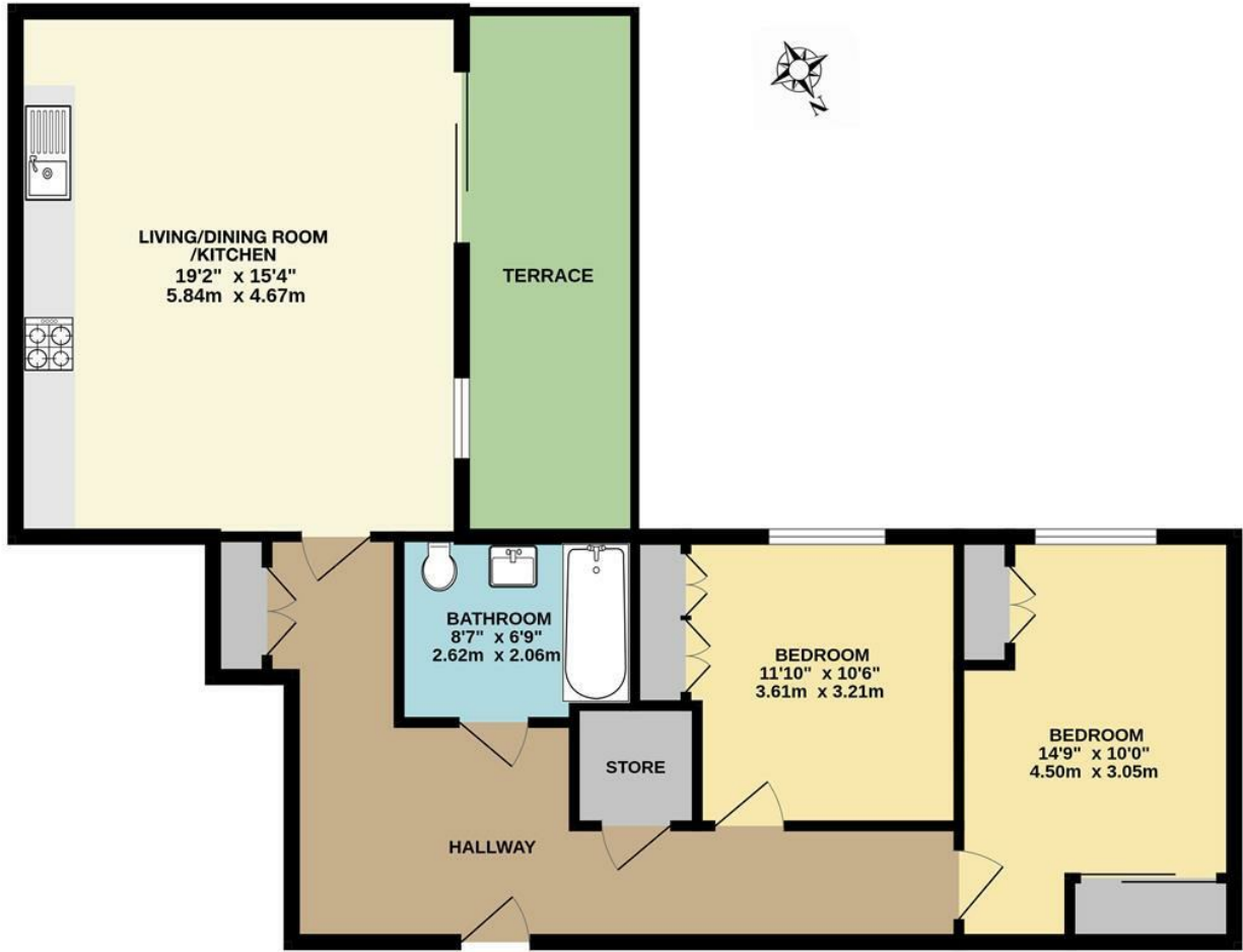
FIRST FLOOR FLAT

INDIGO SQUARE, SURBITON INTERNAL FLOOR AREA (APPROX.) 845 sq ft/ 78.5 sq m