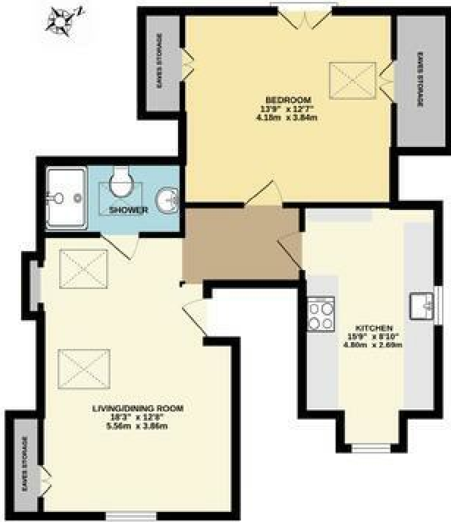
TOP FLOOR FLAT

HOOK ROAD, SURBITON INTERNAL FLOOR AREA (APPROX.) 670 sq ft/ 62.25 sq m Including Eaves Storage