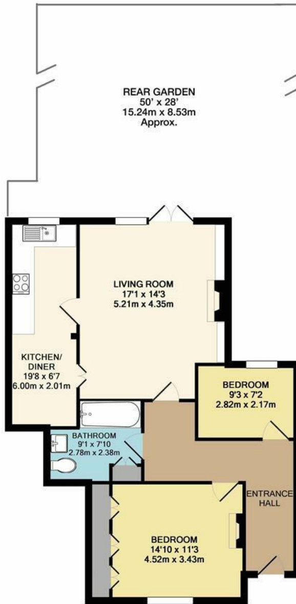
GROUND FLOOR GARDEN FLAT

UPPER BRIGHTON ROAD, SURBITON INTERNAL FLOOR AREA (APPROX.) 785 sq ft/ 72.9 sq m