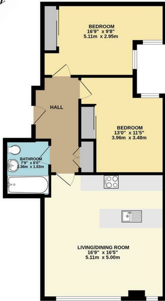
GROUND FLOOR FLAT

MAPLE ROAD, SURBITON INTERNAL FLOOR AREA (APPROX.) 672 sq ft/ 62.4 sq m