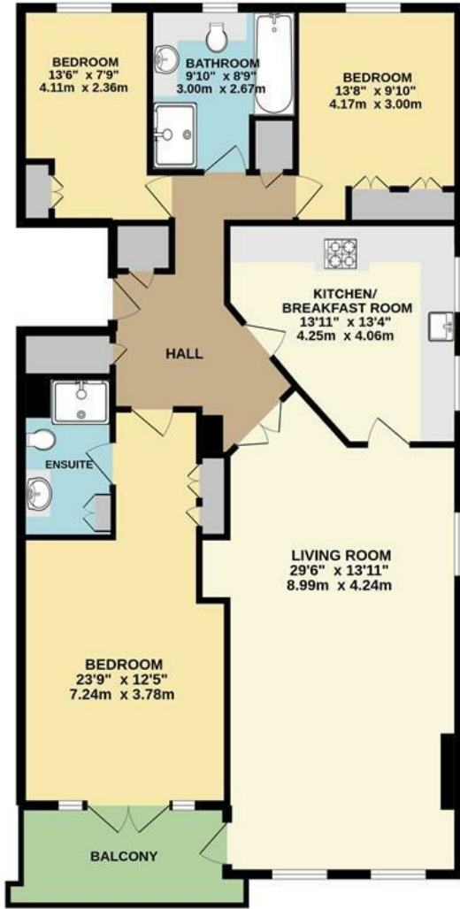
FIRST FLOOR FLAT

Whilst every attempt has been made to ensure the accuracy of this floor plan, measurement of doors, windows, rooms and any other items are approximate and no responsibility is taken for any error, omission or mis-statement. Made with Metropix © 2022.