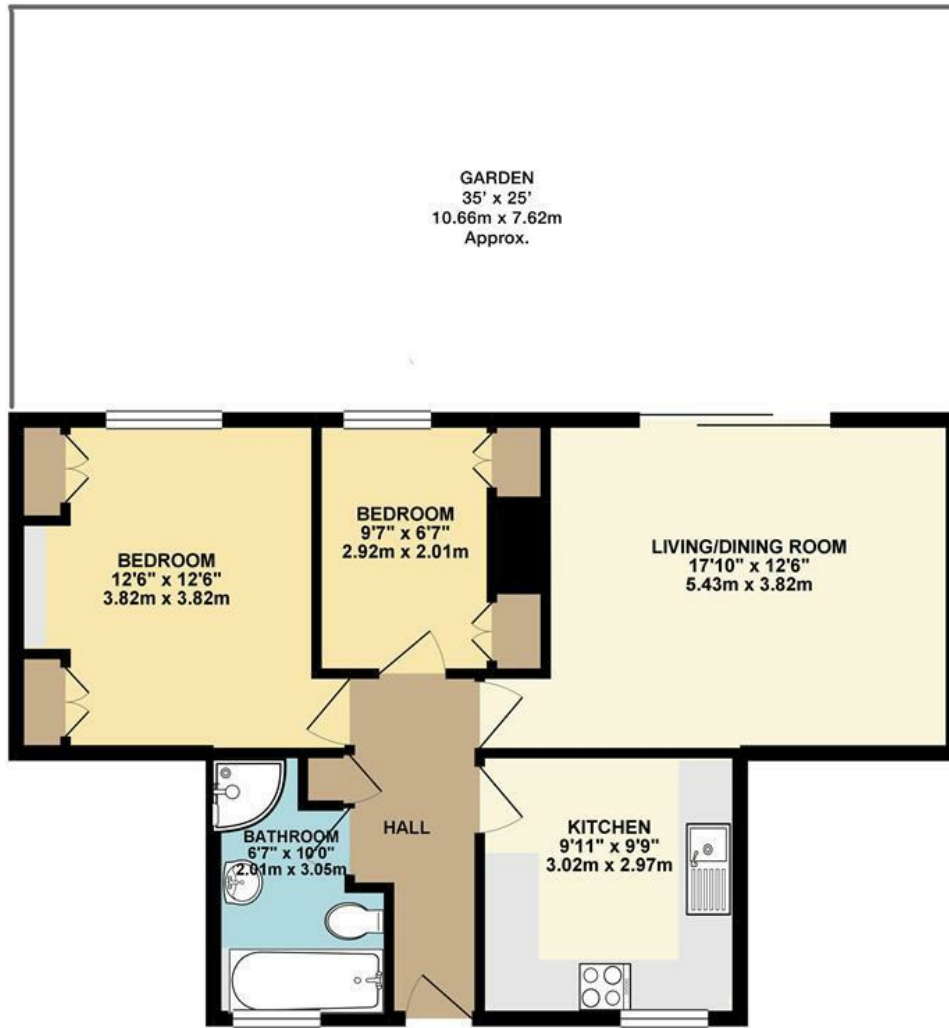
GROUND FLOOR FLAT