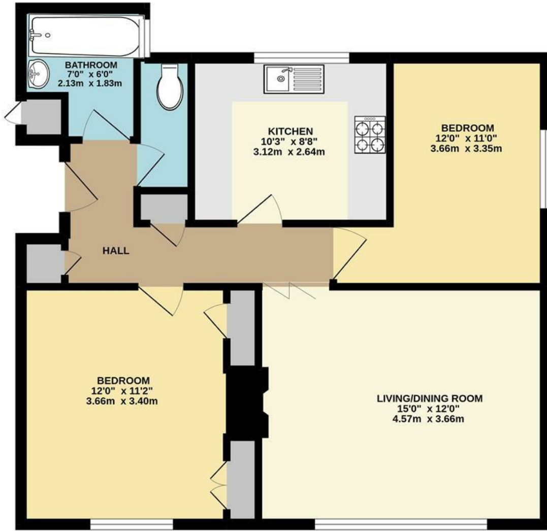
FIRST FLOOR FLAT