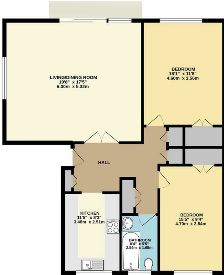
GROUND FLOOR FLAT

HERNE ROAD, SURBITON INTERNAL FLOOR AREA (APPROX.) 975 sq ft/ 90.58 sq m