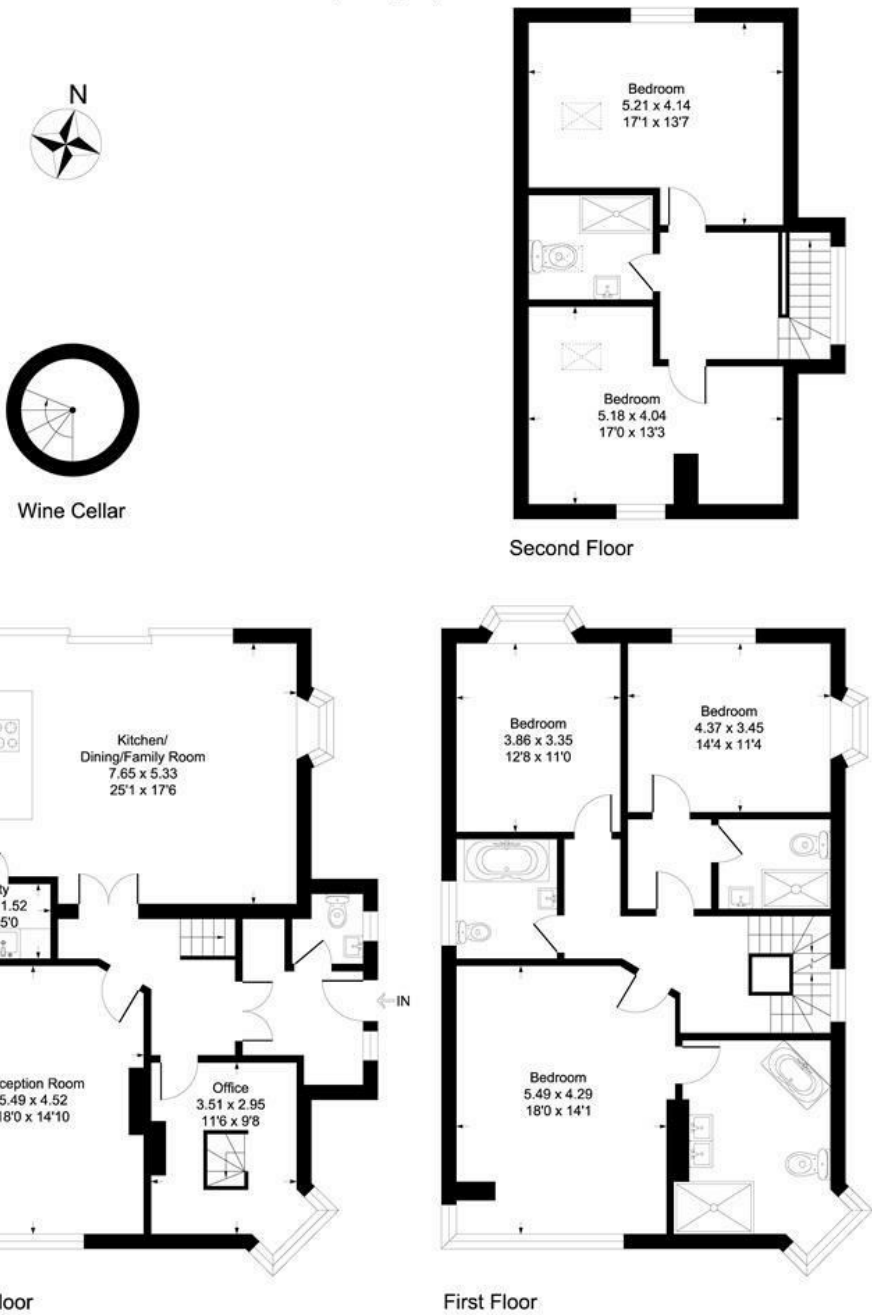
Illustration for identification purposes only, measurements are approximate, not to scale. Produced By Esjay Property Marketing

Approximate Gross Internal Floor Area = 258.3 sq m / 2781 sq ft (Excluding Void)