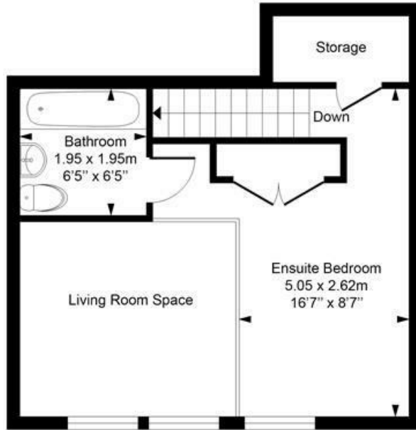
Second Floor (Mezzanine)

Approximate Gross Internal Area = 68.7 Sq m / 739 sq ft