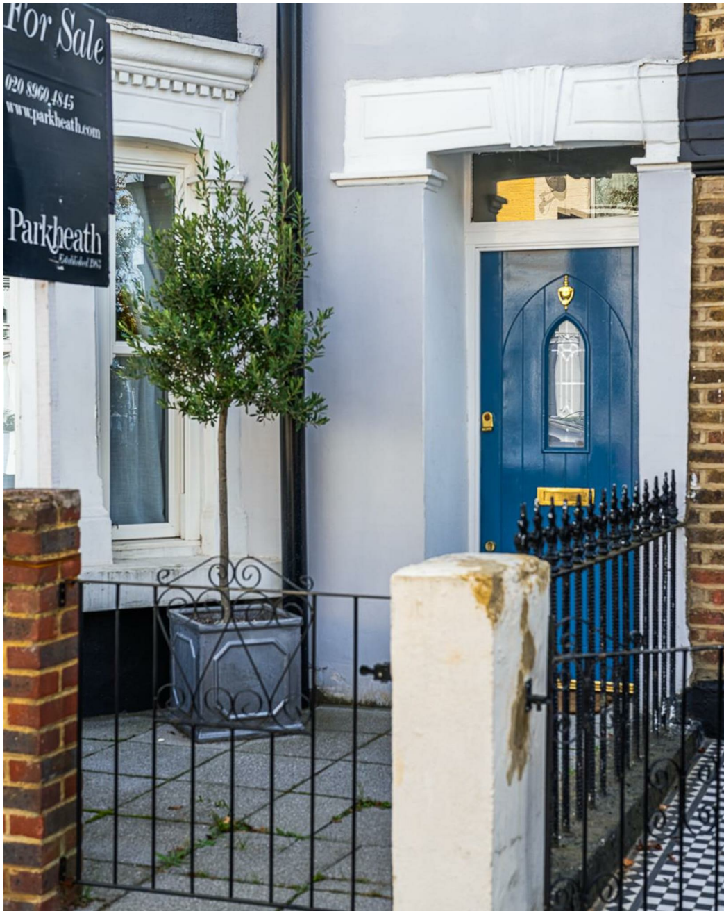
Waldo Road NW10