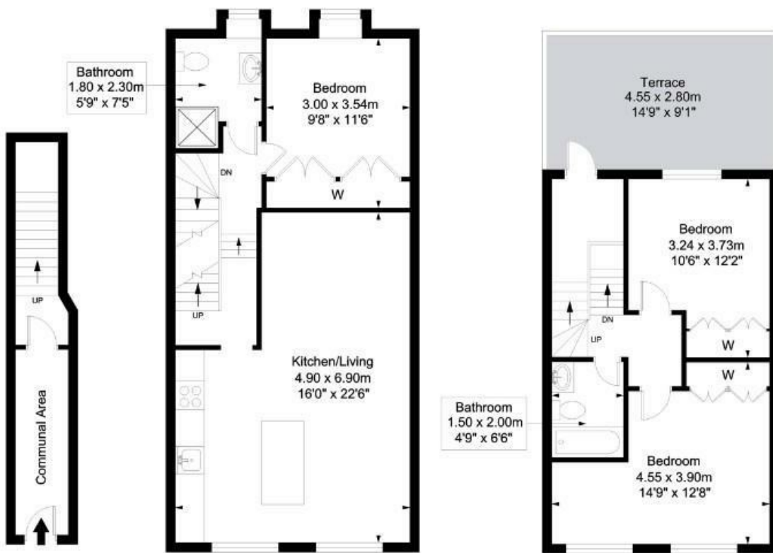
Entrance Ground Floor