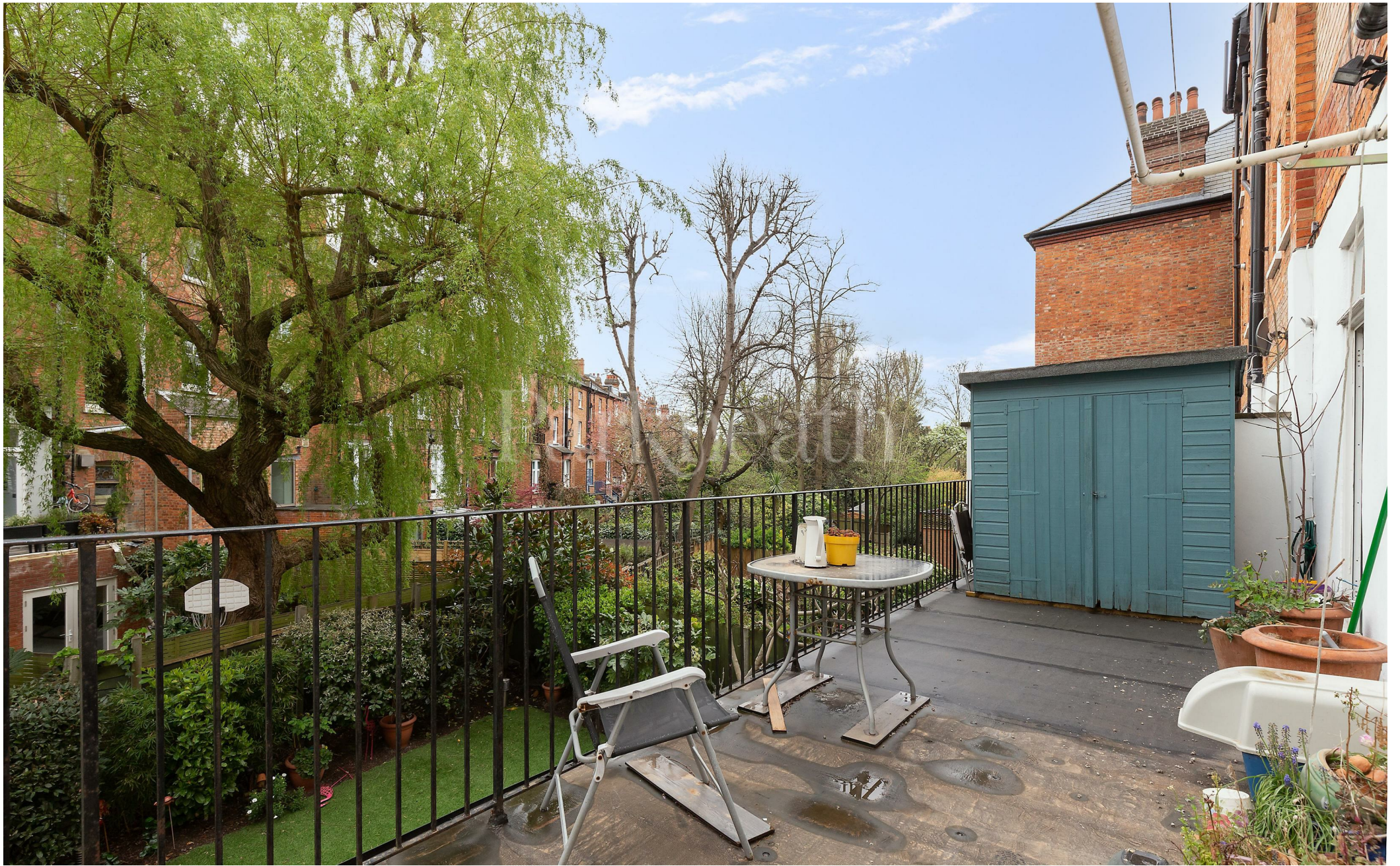
Greencroft Gardens NW6