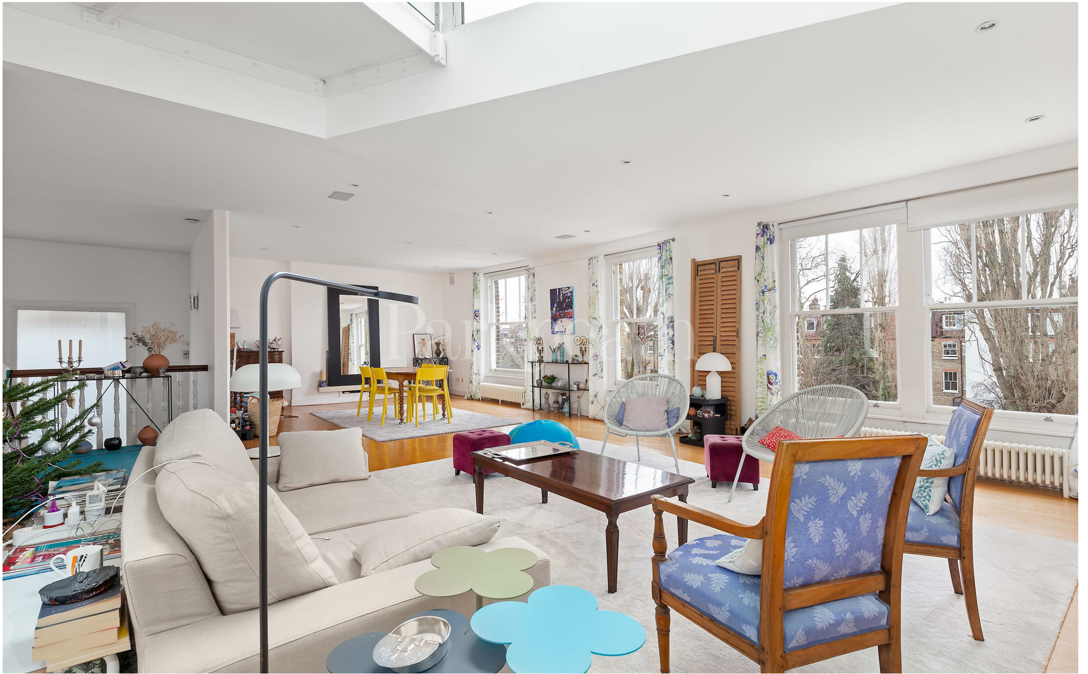
Canfield Gardens NW6