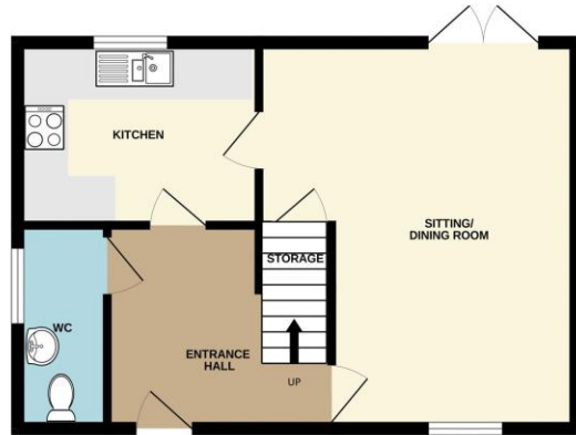
GROUND FLOOR 426 sq.ft. (39.6 sq.m.) approx.