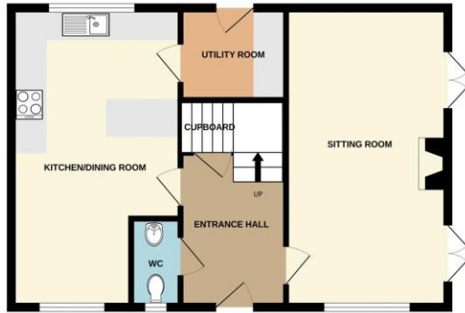
GROUND FLOOR 567 sq.ft. (52.7 sq.m.) approx.