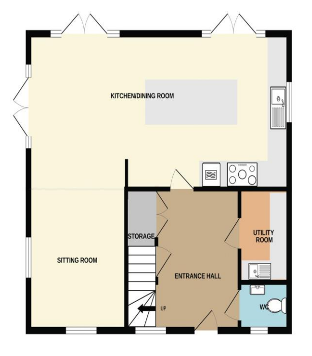
1ST FLOOR 654 sq.ft. (60.8 sq.m.) approx.

GROUND FLOOR 677 sq.ft. (62.9 sq.m.) approx.