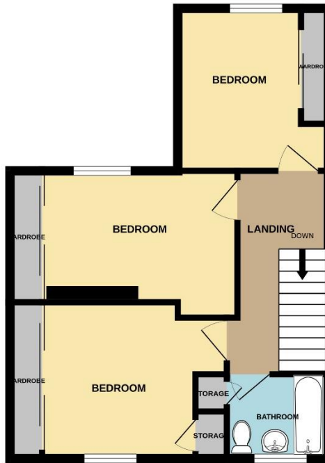
1ST FLOOR 457 sq.ft. (42.4 sq.m.) approx.