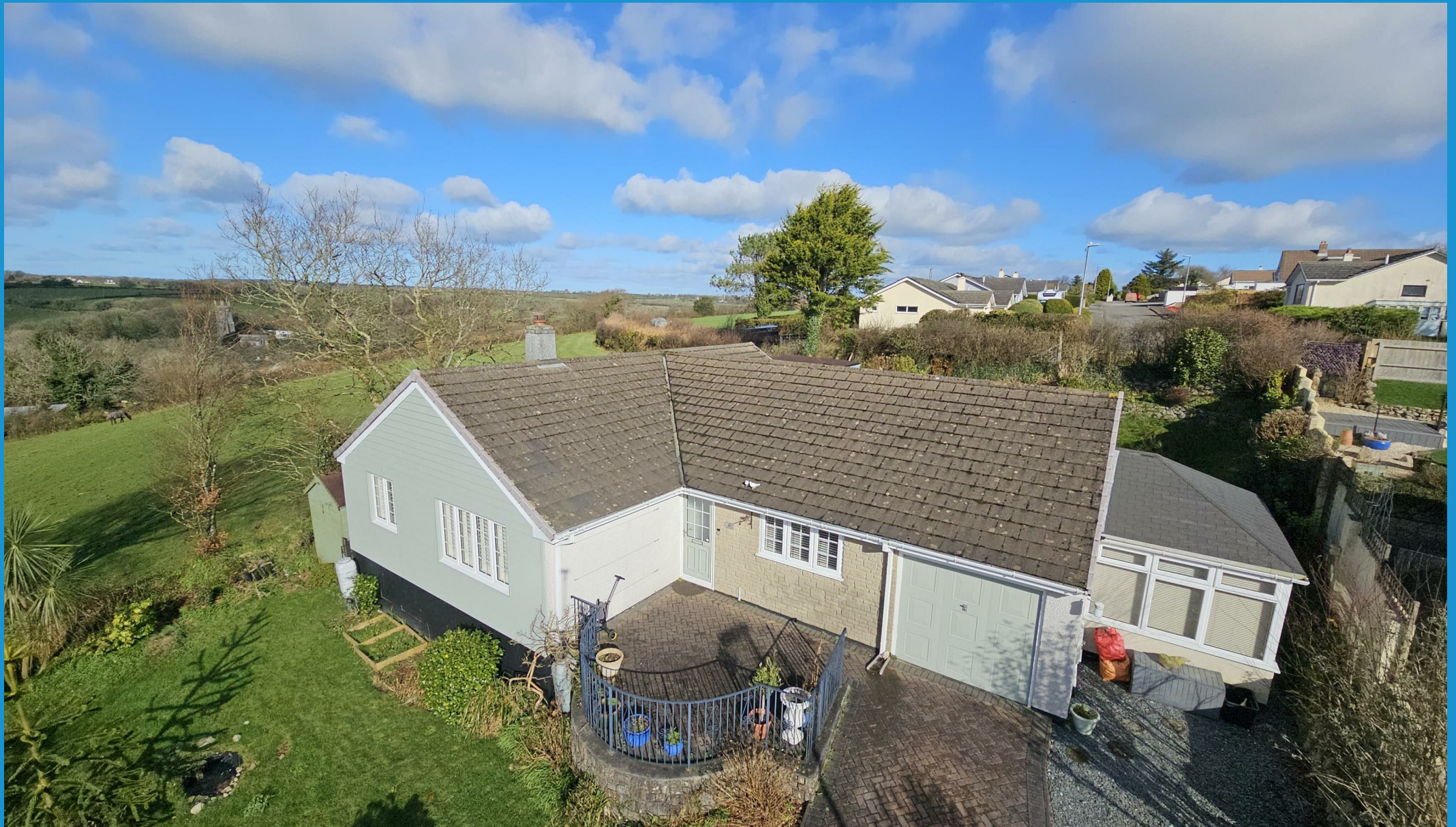
Thorn Close Five Lanes | Launceston