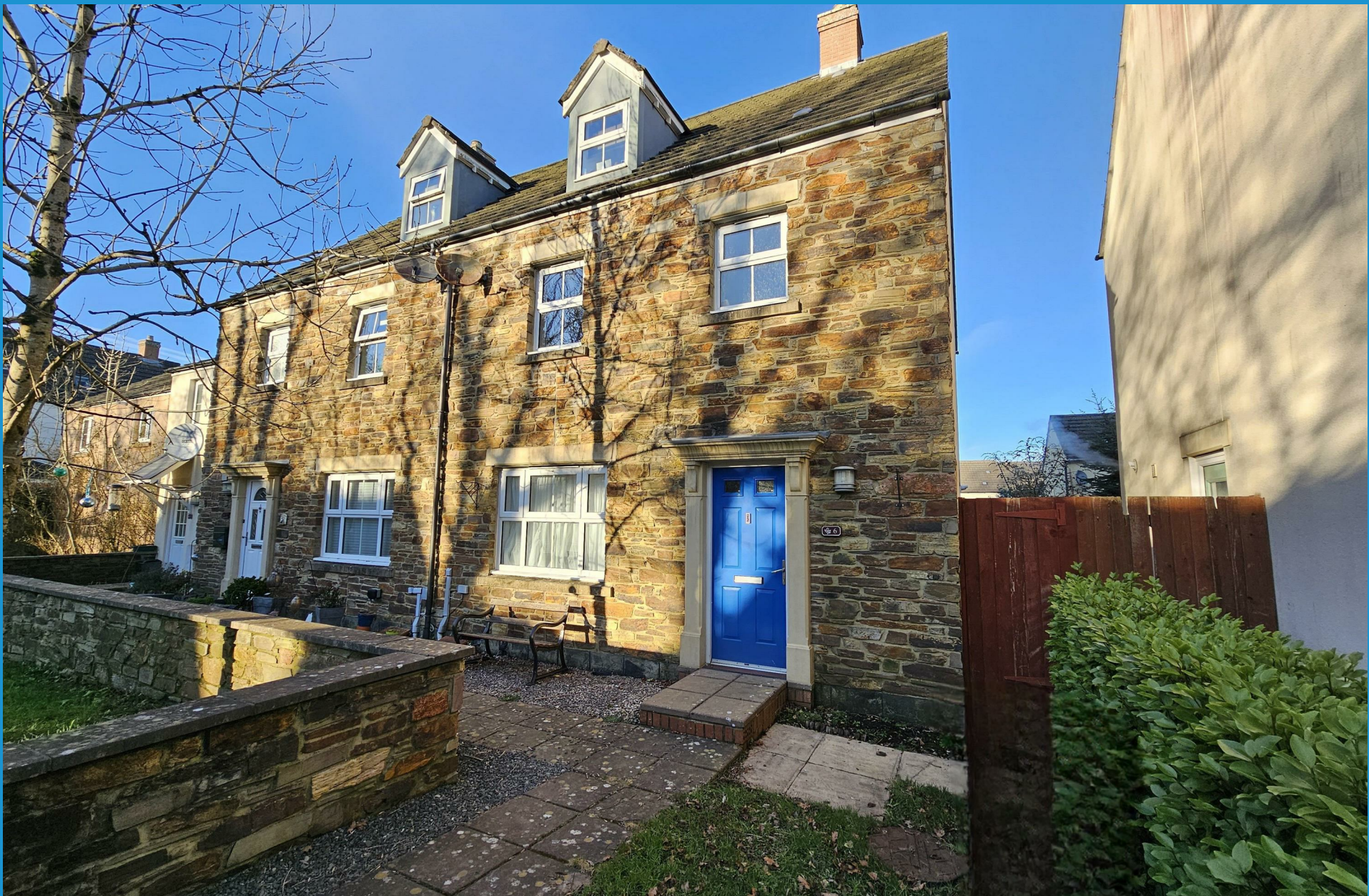
Stourscombe Walk Launceston | Cornwall