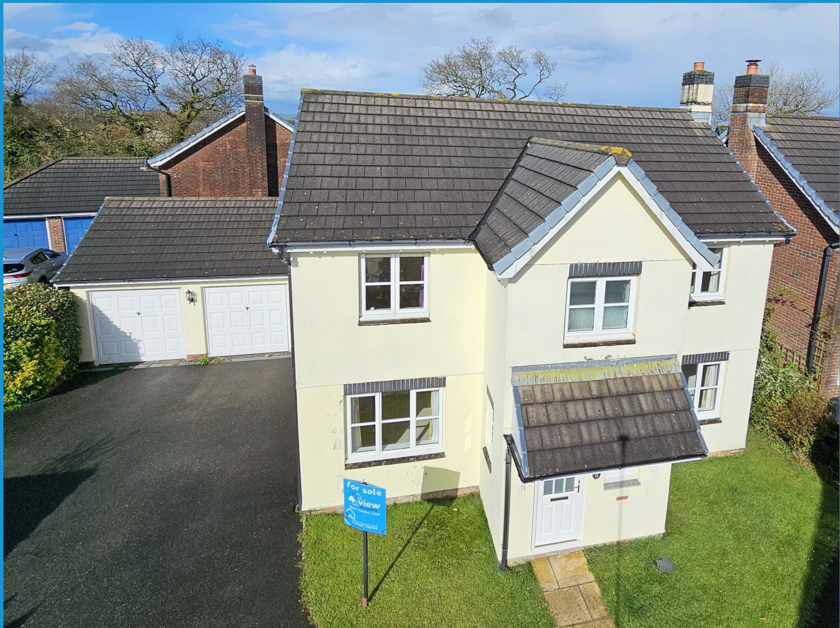
Robin Drive Launceston | Cornwall