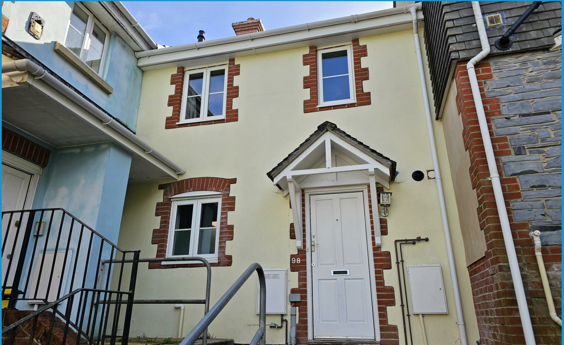
98 Kensey Valley Meadow Launceston | Cornwall