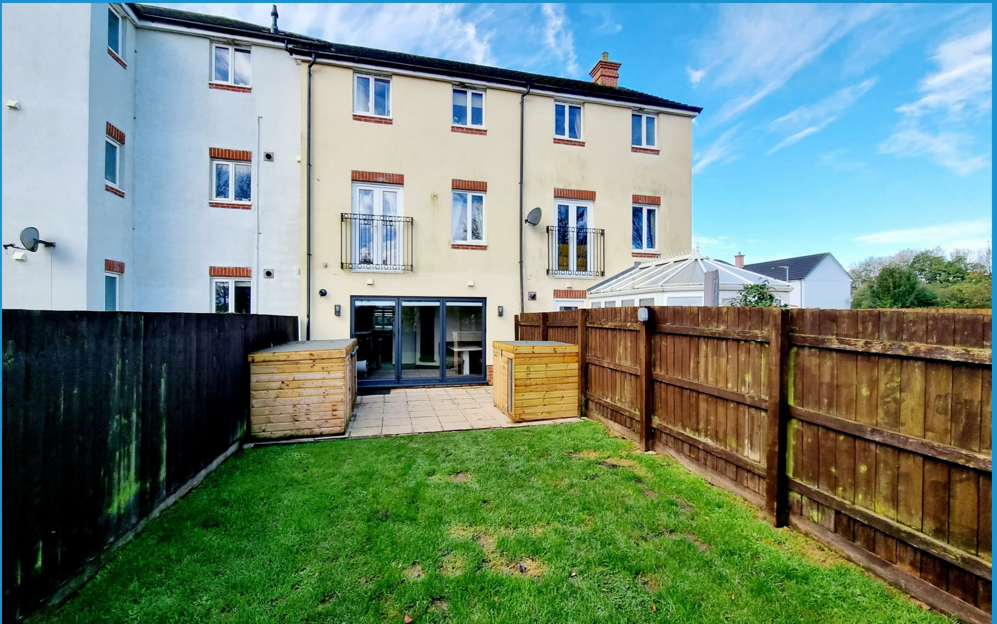
Kensey Valley Meadow Launceston | Cornwall