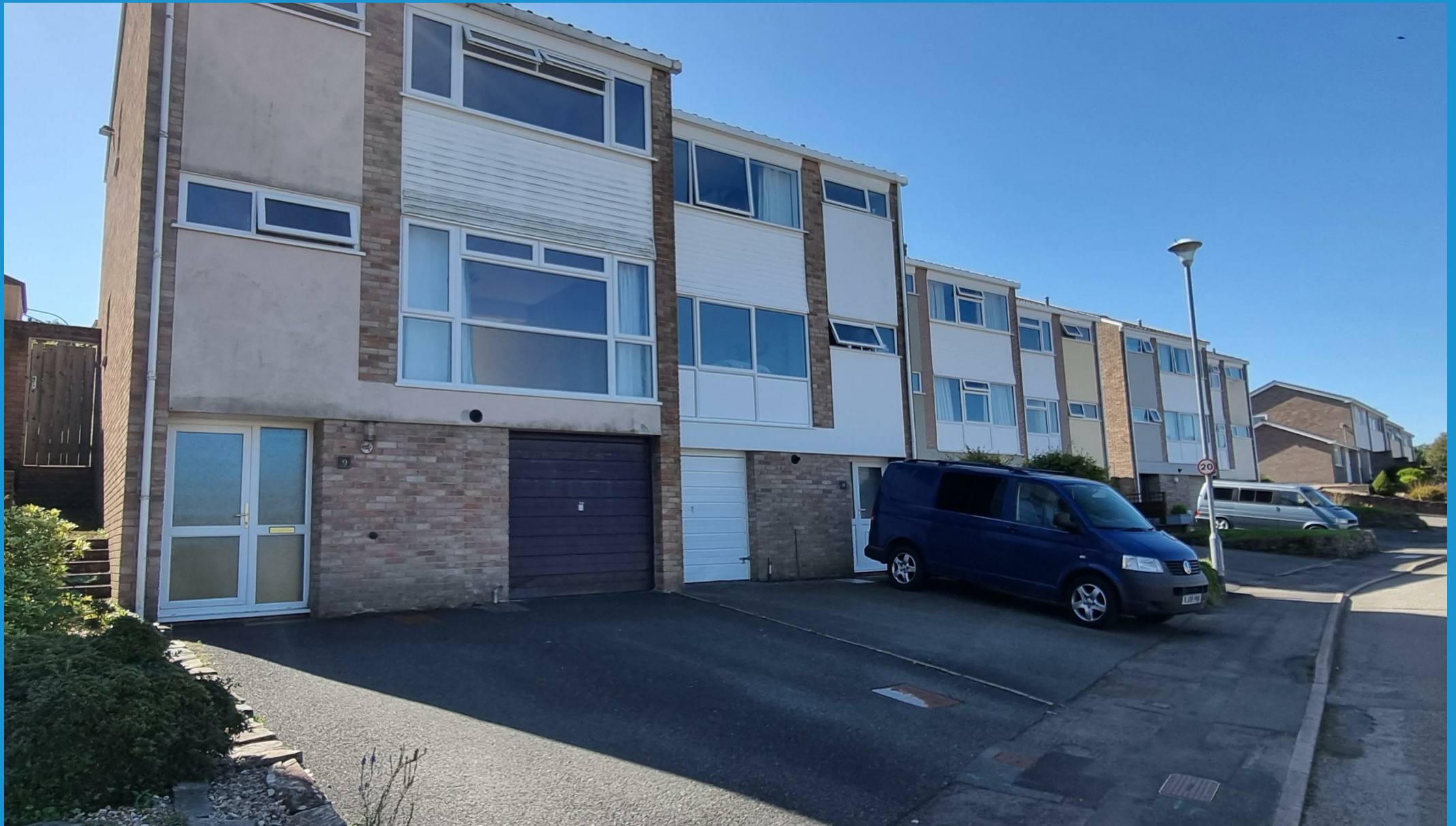
Castle Meadows Launceston | Cornwall