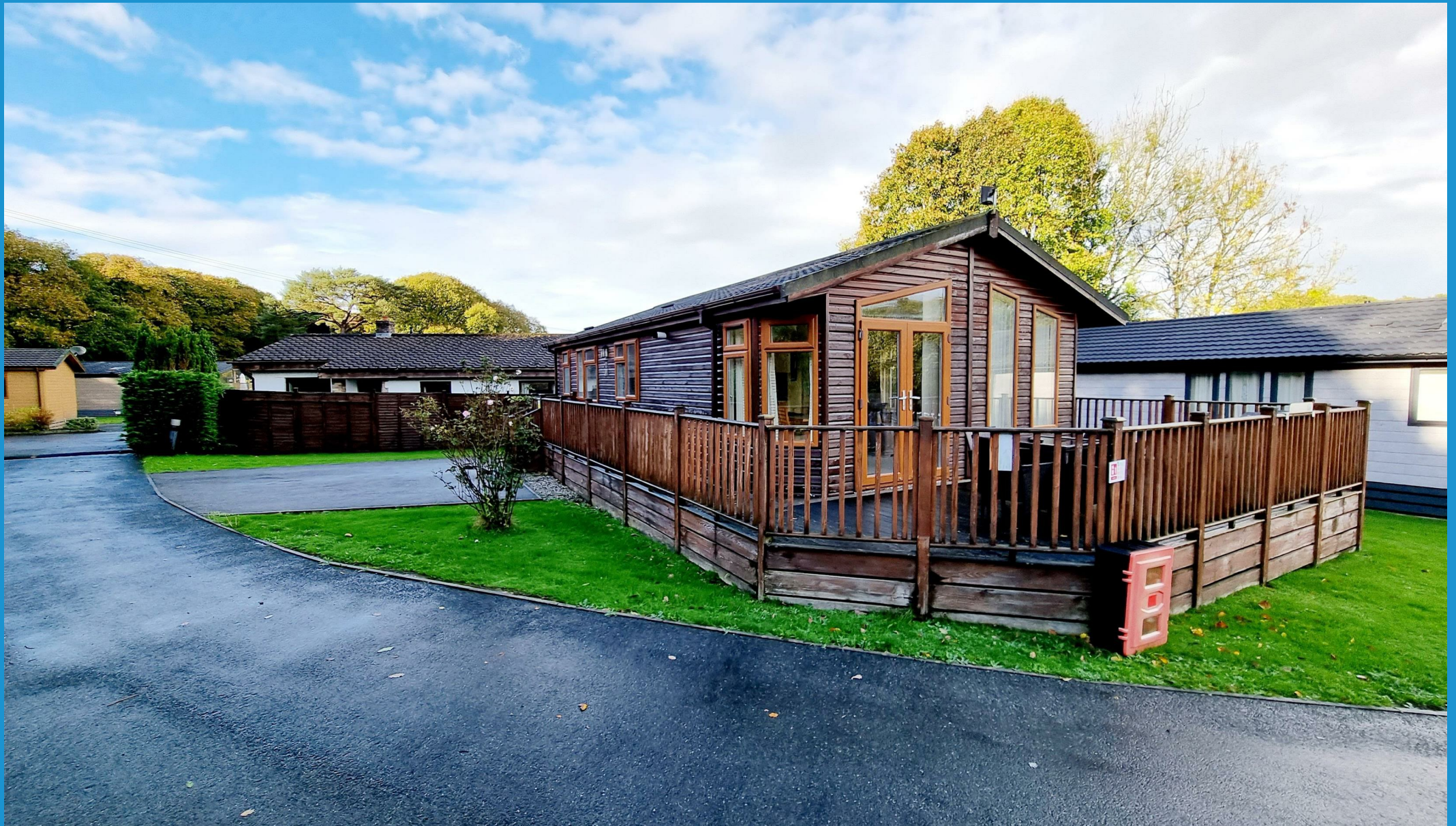
Lodge 6 Willow Bay Park Whitstone | Cornwall