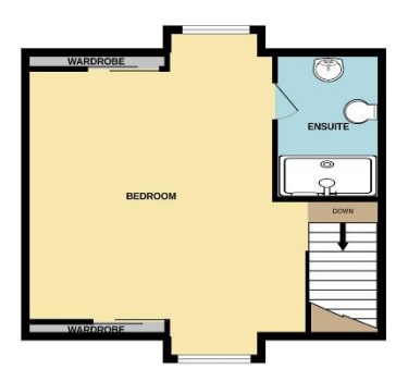
Whilst every attempt has been made to ensure the accuracy of the floorplan contained here, measurements of doors, windows, rooms and any other items are approximate and no responsibility is siden for any error, prospective purchaser. The services, systems and applicances shown have not been tested and no guarantee as to their operability or efficiency can be given. Made with Methops, 62022