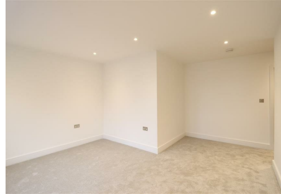
Bedroom 1 walk in wardrobe 5'8" x 7'3" (1.74 x 2.21)