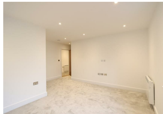
Bedroom 2 15'9" x 13'6" (4.82 x 4.12)