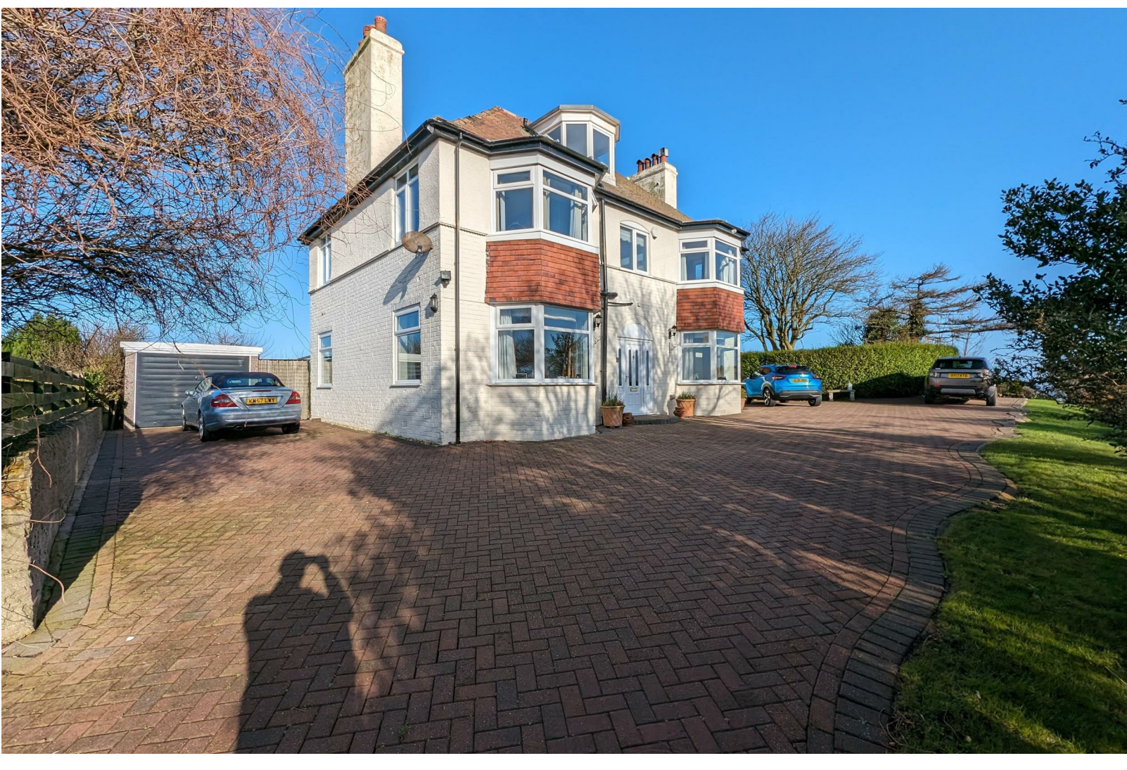
Guide Price £750,000