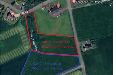
Land 1 Near Watering House, Longhope, Longhope, KW16 3PG Offers Over £35,000

K Allan Properties are delighted to present this area of land to the market which is positioned on Longhope, Hoy. The land, which is approx. 1.2 acres, overlooks the surrounding countryside and benefits from elevated panoramic sea views and a burn surrounded by trees.