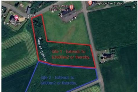
Land 2 Near Watering House, Longhope, Longhope, KW16 3PG Offers Over £35,000

K Allan Properties are delighted to present this area of land to the market which is positioned on Longhope, Hoy. The land, which is approx. 1.6 acres, overlooks the surrounding countryside and benefits from elevated panoramic sea views and a burn surrounded by trees.