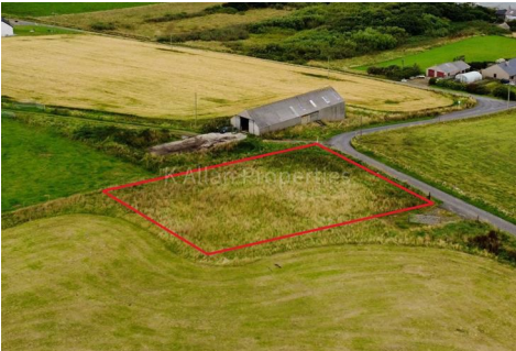
Land Near Midtown, Herston, South Ronalday, Orkney, KW17 2RH Offers Over £45,000

K Allan Properties are delighted to present this lovely elevated plot over looking Widewall Bay benefiting from ready to connect water and electricity.