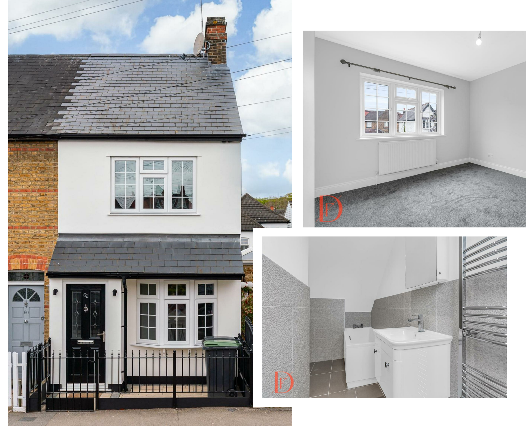
Your Next Chapter