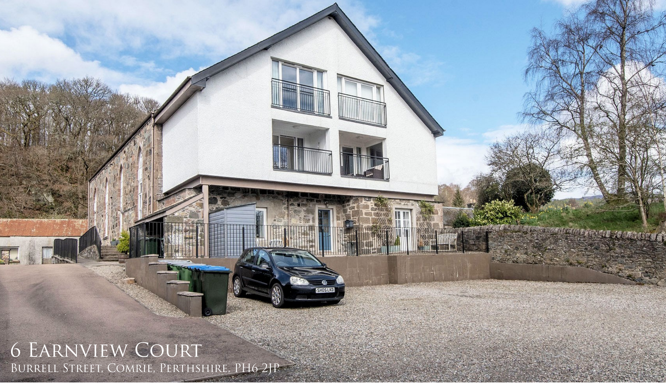
6 EARNVIEW COURT BURRELL STREET, COMRIE, PERTHSHIRE, PH6 2JP