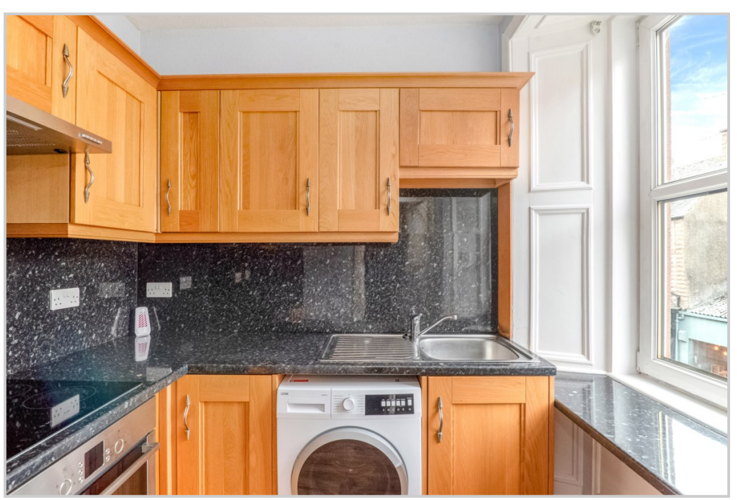
These particulars are believed to be correct, but their accuracy is not guaranteed and they do not form part of any contract. All measurements shown are approximate only.