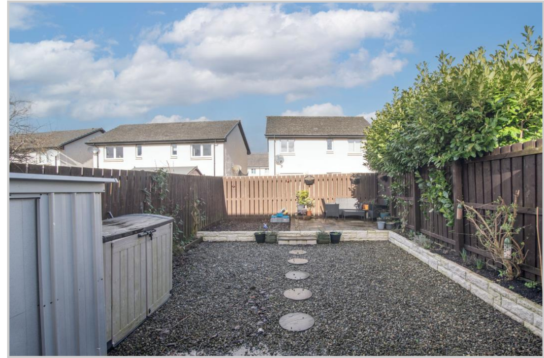
These particulars are believed to be correct, but their accuracy is not guaranteed and they do not form part of any contract. All measurements are approximate only.