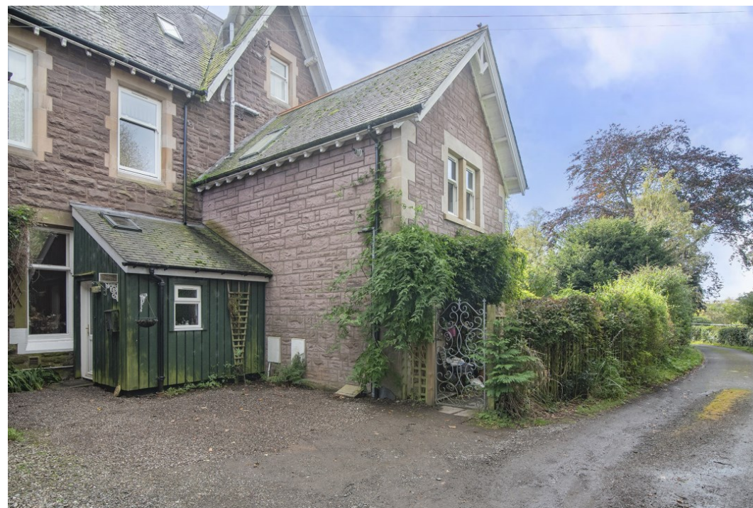
These particulars are believed to be correct, but their accuracy is not guaranteed and they do not form part of any contract. All measurements are approximate only.