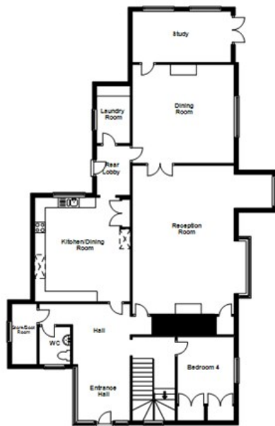
First Floor approx 110.7 sq metres (1191.4 sq feet)