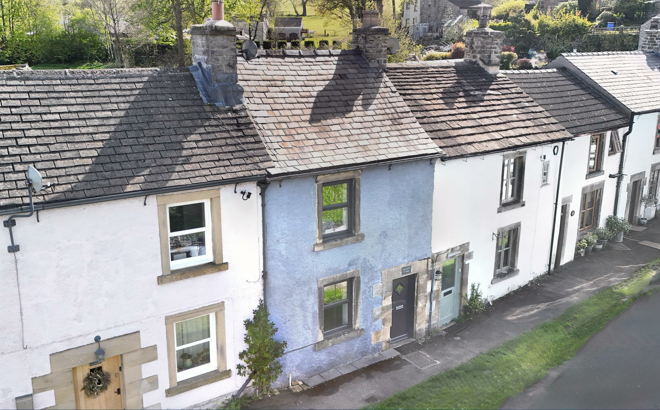
Shamrock Cottage, Church Street, Bradwell, Derbyshire, S33 9HJ