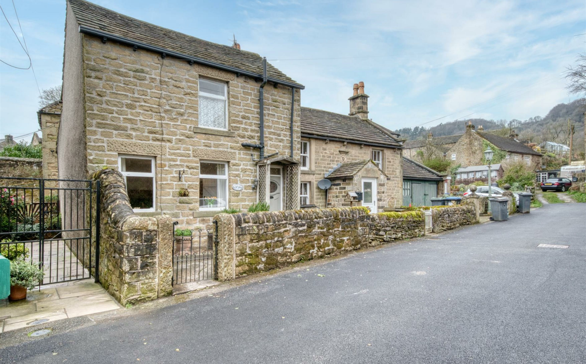
Hawthorn Cottage Little Edge, Eyam, S32 5RN