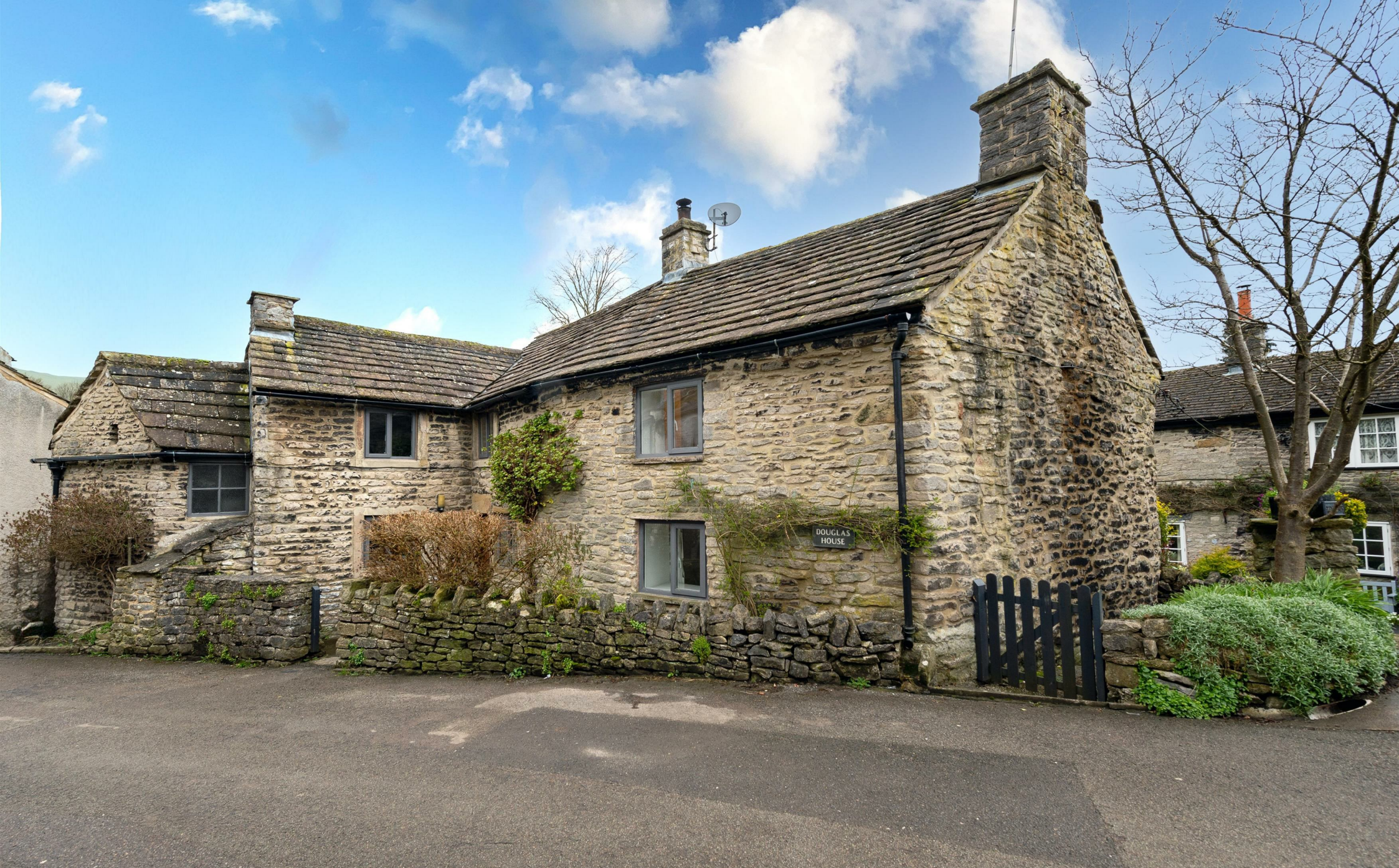
Douglas House The Stones, Castleton, Hope Valley, S33 8WX