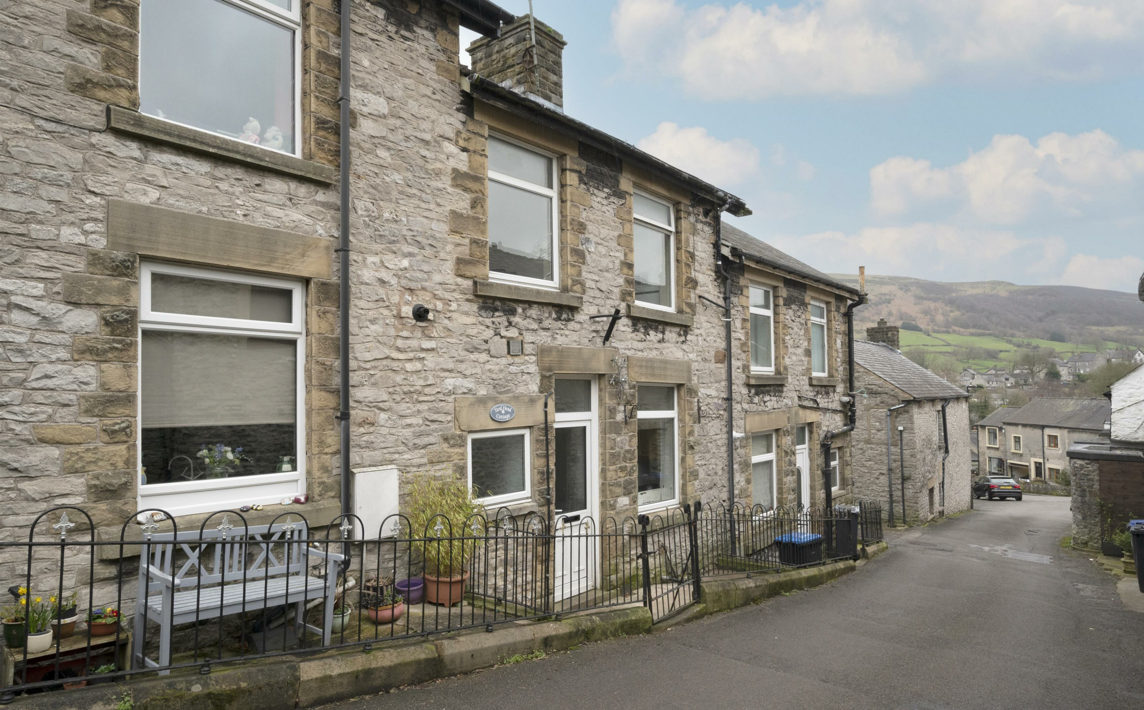
Yard Head Cottage, Towngate, Bradwell, Hope Valley, S33 9JX